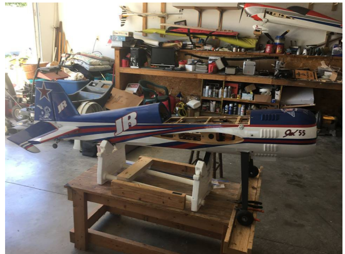
Tamas's Workshop of Wonders