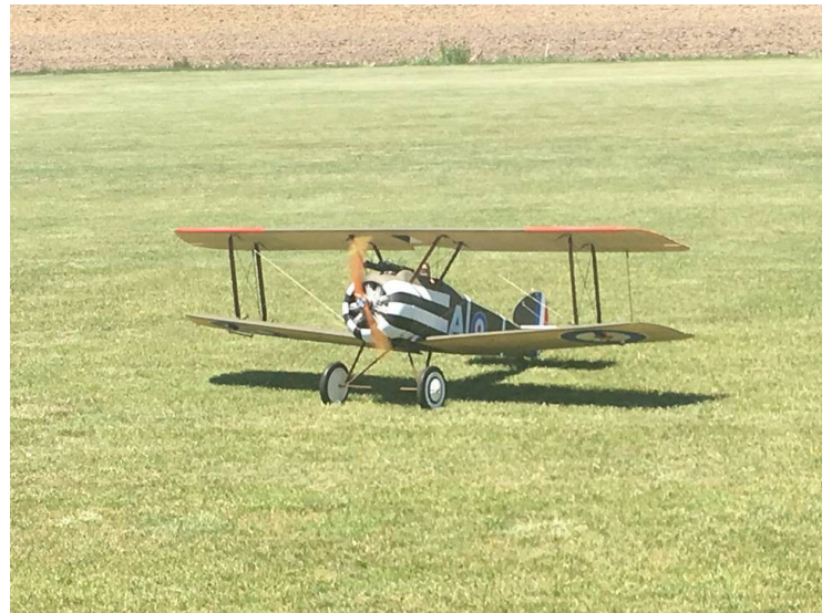
Tamas's beautiful Camel