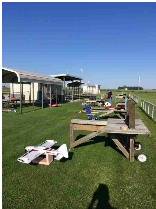
There were actually 7 of us Club members at the field on this sunny morning!