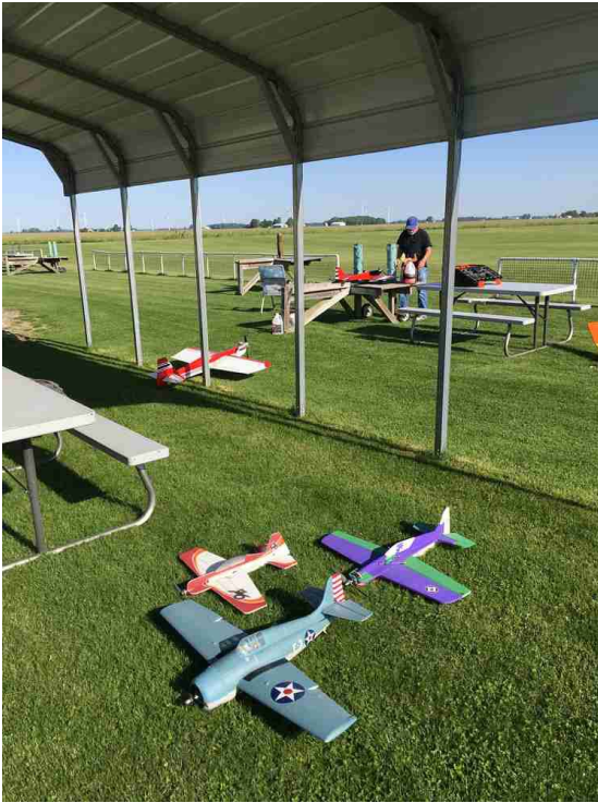
The electric powered half of my fleet